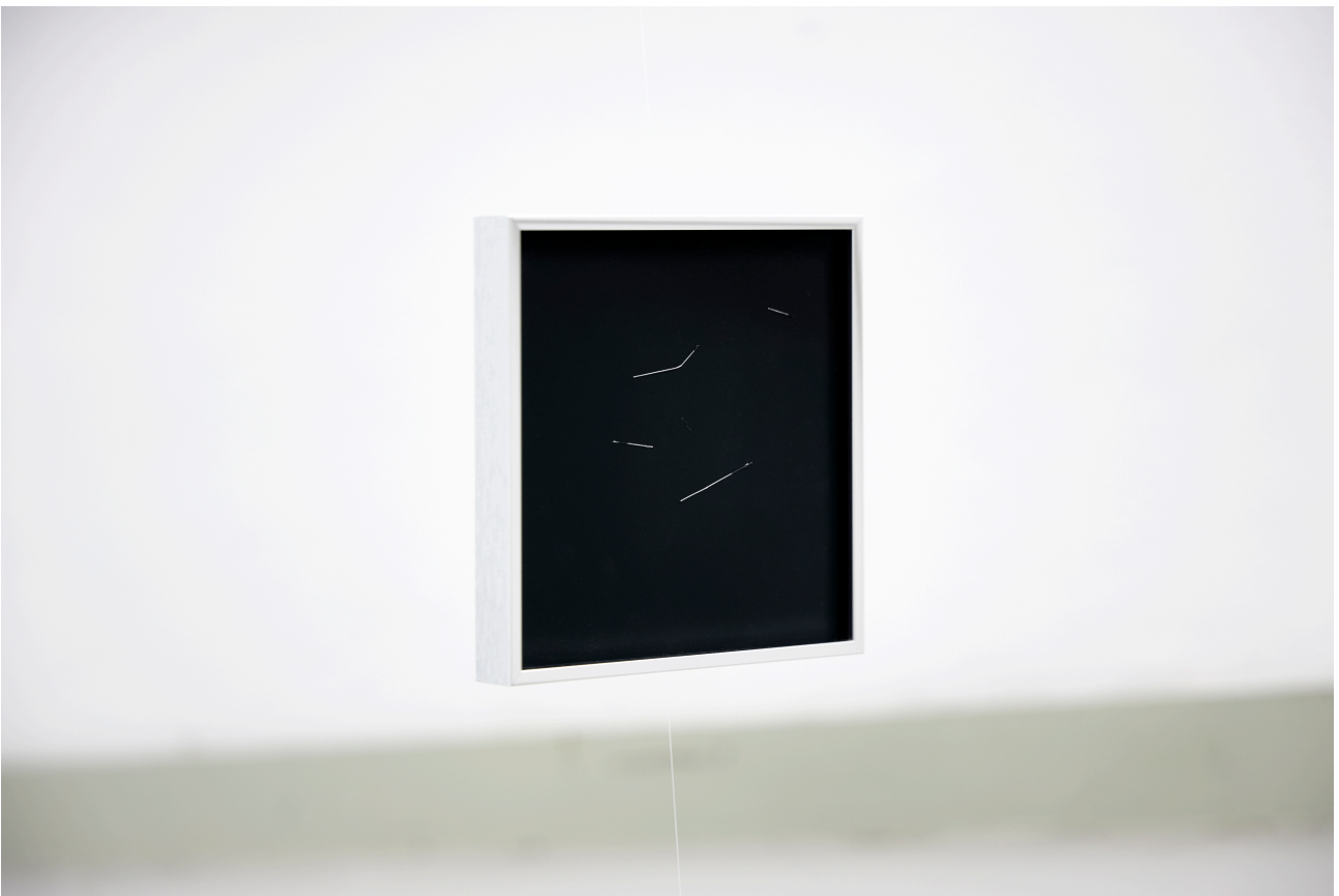
Filaments (top: Crossing Center , bottom: Clinging ), 2025, nylon mounted on paper, 14.5 × 14.5cm, framed in aluminum, 15 × 15cm, installation view, Seeburg – Boat Hall, Kiel, December 13, 2025 – January 17, 2026.