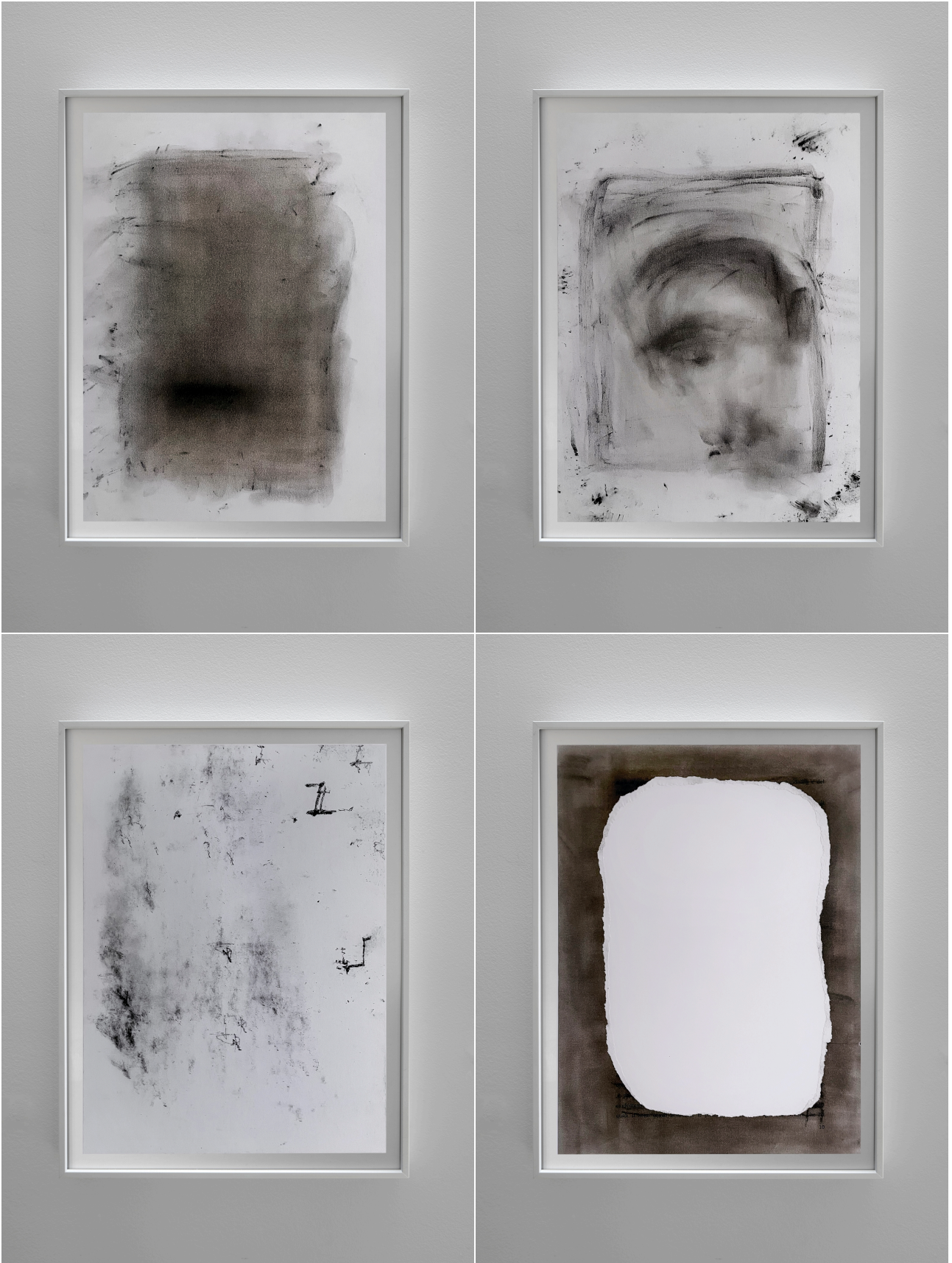
Rimasto (top left: Rimasto , top right: Lui , bottom left: ZZ , bottom right: Fine ), 2023–2026, series of 5 drawings, pastel on paper, 21.0 × 29.7 cm, framed in white aluminum, 24 × 32.7 cm, EWZ Unterwerk Seltau, Zurich, May 8 – June 14, 2026.