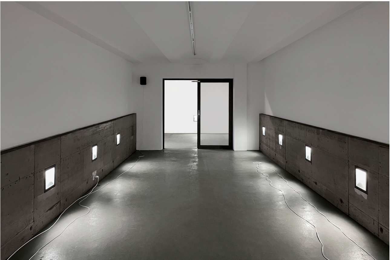
Run Run Run , 2026, sound (spoken words, recorded actions), 1'01", 3 + 1 AP, installation view, EWZ Unterwerk Selnau, Zurich, May 8 – June 14, 2026.