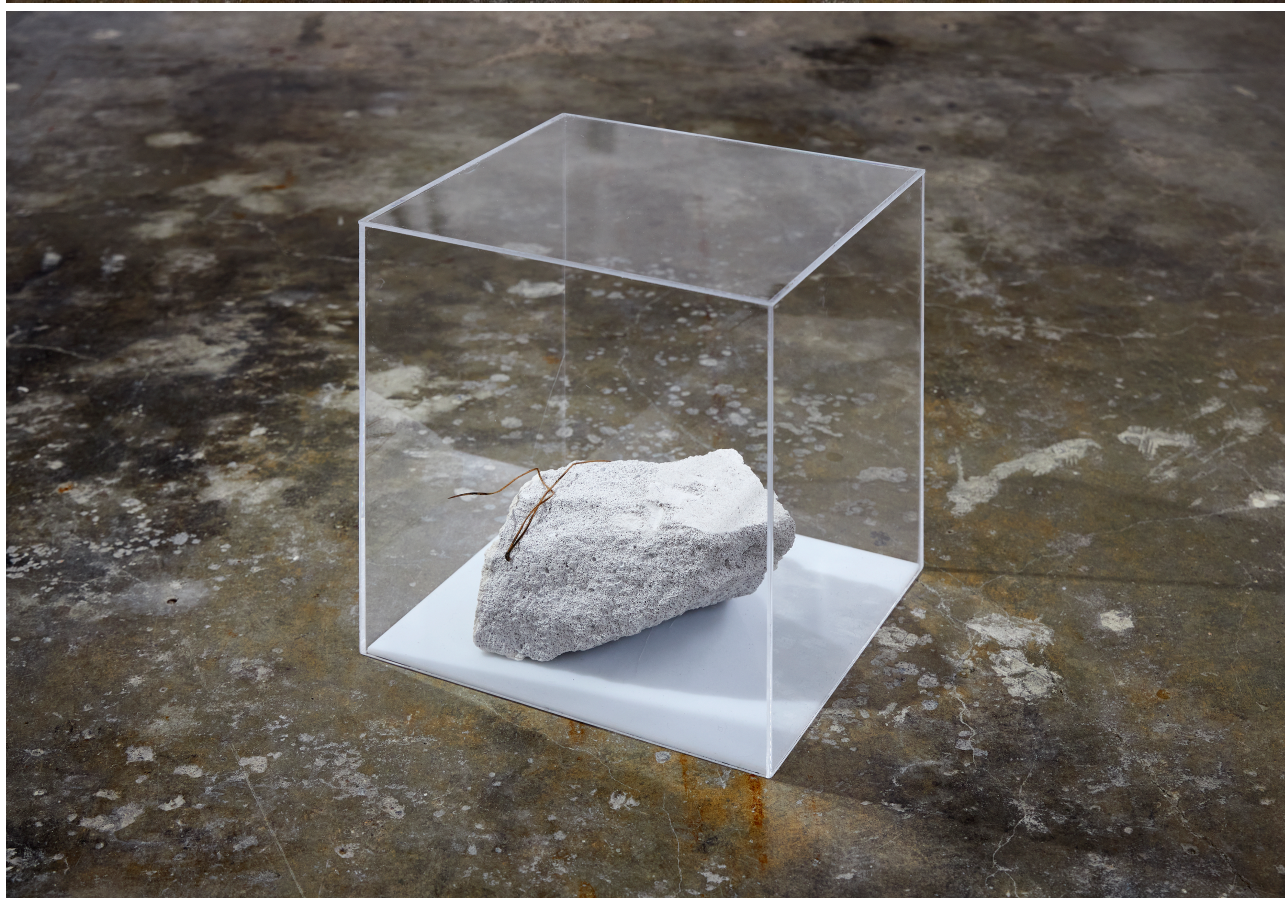
Strings and Stones , 2025, pine needles mounted on stone, top: Broken Horse , 25 × 13 × 14 cm, framed in plexiglas, 34 × 16.5 × 40 cm; bottom: Face Fall , 16.5 × 16 × 8 cm, framed in plexiglas, 22.5 × 21 × 25 cm, installation view, Seeburg – Boat Hall, Kiel, December 13, 2025 – January 17, 2026.