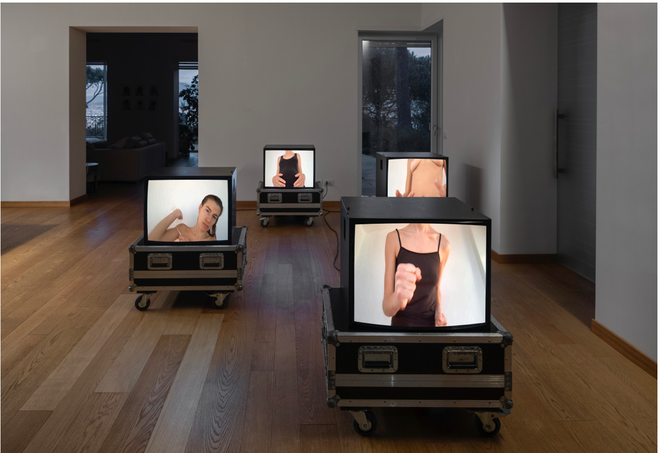
Welcome to My Gym , 2024, eight video performances (color, sound), duration per single video performance: 0'44" – 4'17", Hantarex monitor, 61 × 46 × 48 cm, 3 + 1 AP, installation view, 480 Site Specific, Naples, December 6, 2024 – January 6, 2025, Photo: Maurizio Esposito.