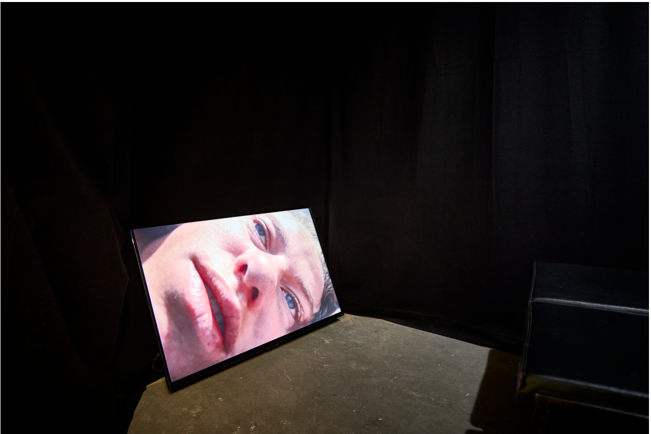
Head Down (top: Sun Kiss , bottom: Head over Heels I ), 2025, installation view, series of 7 video performances (color, silent), 9'08", 42" monitor, 3 + 1 AP, installation view, Seeburg – Boat Hall, Kiel, December 13, 2025 – January 17, 2026.