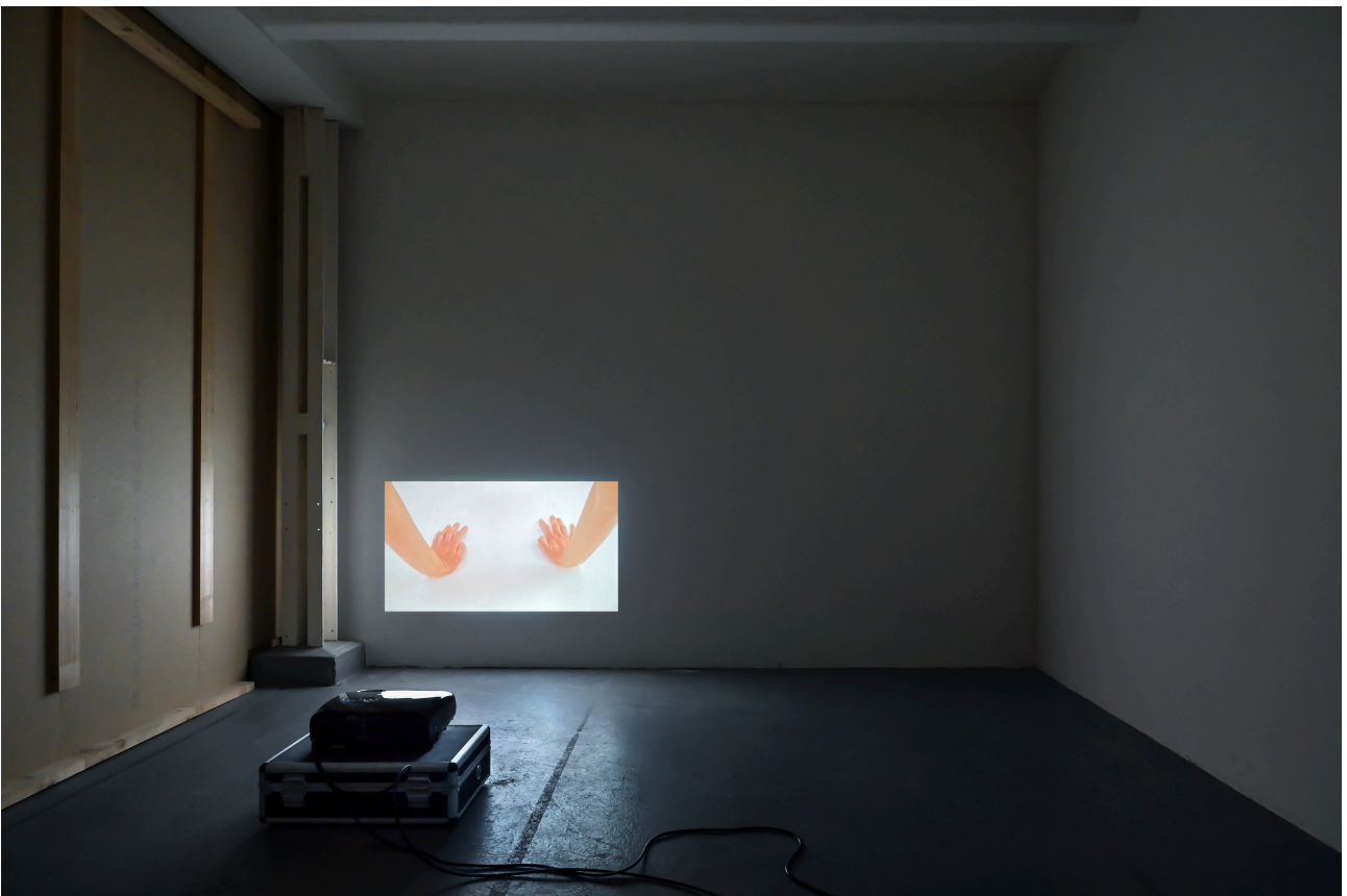
Running against my shadow , 2024, video performance (color, sound), 1'34", 3 + 1 AP, installation view, EWZ Unterwerk Selnau, Zurich, May 8 – June 14, 2026.